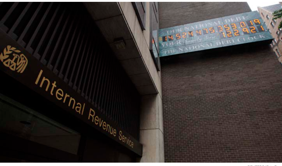
The Justice Department's use of FIRREA suits has been linked closely to its role on the Financial Fraud Task Force, which comprises more than 20 federal agencies, including the SEC and the IRS.

Although the provision was originally viewed as a measure to protect banks from fraud by third parties, three separate courts have recently construed this "affects" requirement broadly and affirmed that a bank can be both a "victim of" and a "participant in" the predicate fraud that gives rise to a FIRREA claim. As a result, FIRREA has become the DOJ's statute of choice when proceeding against financial institutions. Given the serious consequences of a FIRREA suit, financial institutions should be aware of its unique reach and legal standards.