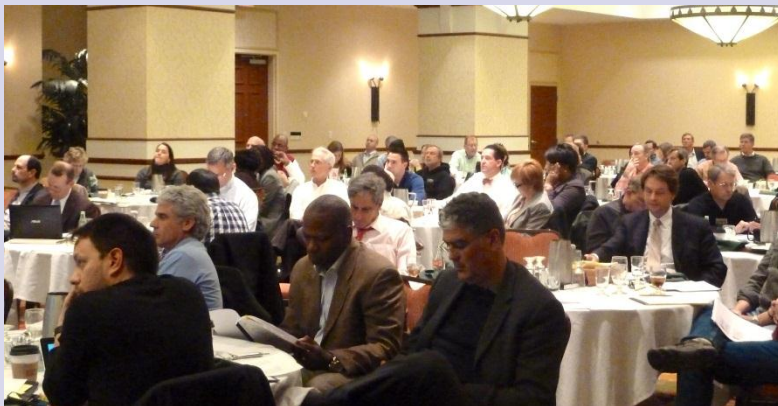
November 20, 2013 CLE by the Office of The Public Defender, Richmond, VA