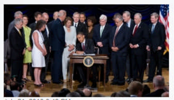
Signing the Wall Street Reform and Consumer Protection Act